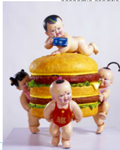
CLICK TO ENLARGE PHOTO